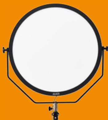
PROFESSIONAL LED STUDIO LIGHTS